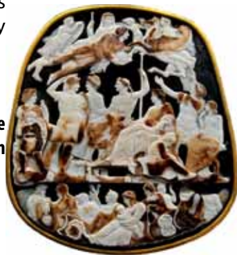
Figure 4: The Grand Camée de France.

city arranged in a concentric hierarchy of diminishing illumination but increasing number ( Ast. 5.735-40). In the heavenly city, the signs of the zodiac are the most bright and thus at the centre. However, earlier in the Astronomica , Augustus was assigned a place in heaven alongside Jupiter in controlling the movement of the zodiac ( Ast. 1.800-804). If we may combine these accounts, we have an image of the heavenly realm which has Augustus and Jupiter side by side ruling over and surrounded by the zodiac, which are in turn surrounded by lesser constellations and then the Milky Way on the periphery. To complete this cosmology we would then need to imagine the earth below with the emperor Tiberius acting as the vice-regent of Jupiter-Augustus above. This very idea is conveyed in the Grand Camée de France which shows Augustus in heaven over the enthroned Tiberius on earth in the centre of the gem, below are the barbarians. The three levels map power in the cosmos, Augustus rules in heaven over Tiberius on earth who rules to the ends of the earth, represented by the barbarians.