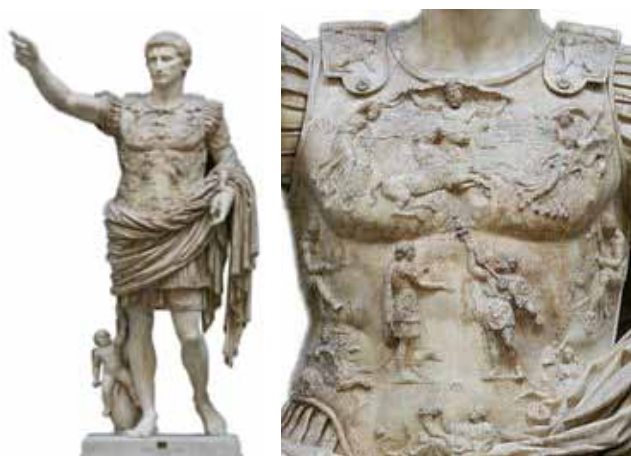
Figure 1: Primaporta statue of Augustus and cuirass detail.

An astrological expression of this ideology appeared on coin types, including the Capricorn with globe. Capricorn was the sign of the zodiac associated with Augustus. It appears with the globe positioned either underneath or