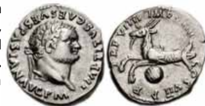
Figure 3: Laureate head of Titus and Capricorn with globe below, Denarius, 79CE.

This aspect of Rome's ideology would be deemed blasphemous because it claimed heavenly authority for the Beast's actions on earth including its persecution of the saints, their subjugation an aspect of the harmony between heaven and earth. In this imperial cosmology, there is no space for the heavenly vindication of the saints who must therefore remain exposed to shame on earth.