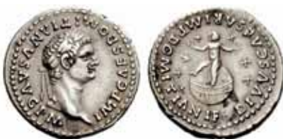
Figure 5: Domitian with laureate head, boy on globe with seven stars, Denarius, 82-83CE.

Starting with Julius Caesar, the apotheosis of the emperor and his family members became common. In the first two weeks of his reign, Domitian deified his dead son, which was represented on a denarius showing the boy as an infant Jupiter in the heavens surrounded by seven stars. In 81 CE Domitian had the Arch of Titus built in Rome which on the top of the inside of the arch shows Titus ascending to heaven on an eagle, the same arch that represents the conquest of the Jerusalem.