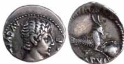
Figure 2: Augustus with Capricorn holding globe between feet, 12 BCE.

between its paws. Such images draw on the belief that events on earth are controlled by the stars and the signs of the zodiac in particular. The Capricorn with globe expresses the idea that this heavenly influence on earth is manifest in the rule of Augustus and Rome.